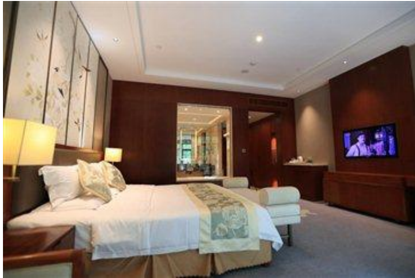
The Cuiliu Hotel Room

4.Binhu Hotel(four-star): please contact Sales Manager Xie Chenghong for room reservation, mobile phone number:13807173292