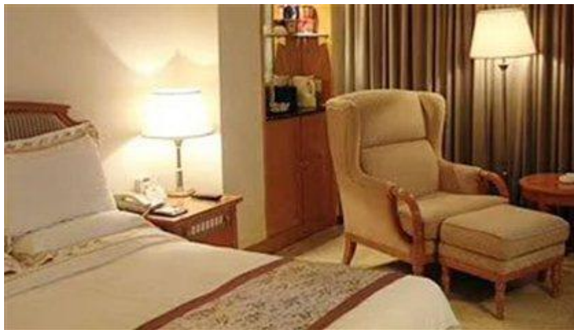
The Binhu Hotel Room

Note: The conference guest room reservation must be submitted with the conference name provided - ICSA China Conference in order to be entitled to the preferential rate prescribed in the room reservation agreement. Booking a room requires paying the