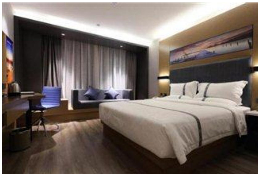
The Yeste Hotel Room

Note: The conference guest room reservation must be submitted with the conference