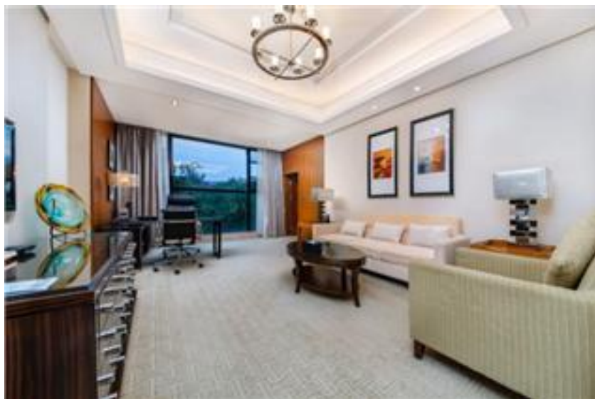
The East Lake Hotel Room

备注: 预定时请务必将入住时间选择在 6.27-7.1 之间, 否则会显示无房可订, 如果时间选择正确, 仍显示无房可订, 说明房间已预订完。房源有限, 先到先得。